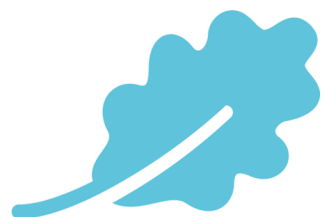
Déjà Brew Coffee Kart