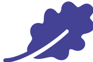
Hospitality & Catering