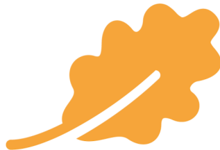
Gardening & Horticulture

Overall, the programme is a chance for learners to gain valuable insights into an industry and explore the various job roles within it.