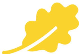
Carpentry & Upcycling