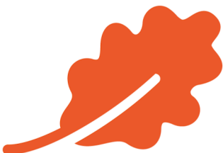
Art & Enterprise