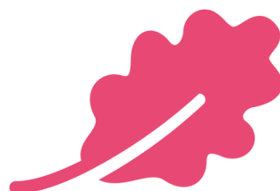
Spill the Beans Café